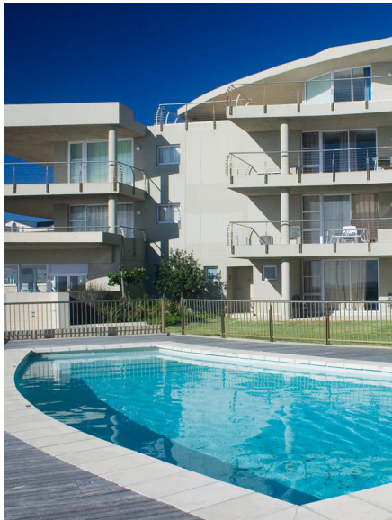
Lagoon Beach Apartments : Milnerton Beach : Cape Town